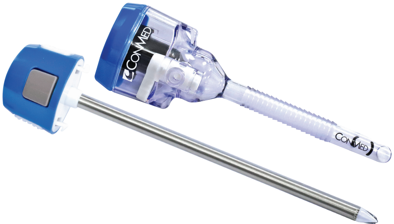
AIRSEAL® ACCESS SYSTEM

BluView™ trocars and cannulas are designed for reliable laparoscopic access without the premium price.